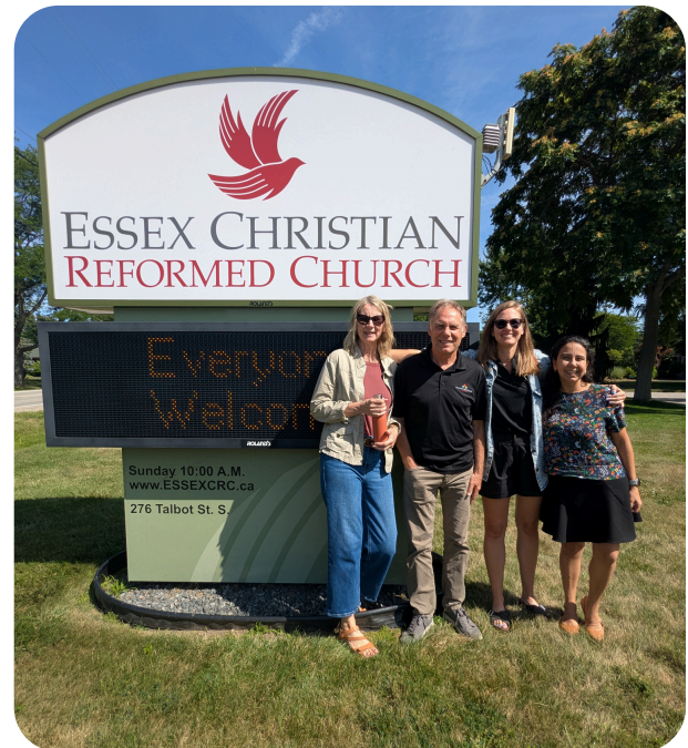
DMC Staff visited various ministries in Classis ONSW this past July

Across Canada, we have been helping deacons and churches learn to see their communities through a lens of abundance —recognizing the gifts, strengths, and God-given assets already present in their neighbourhoods.